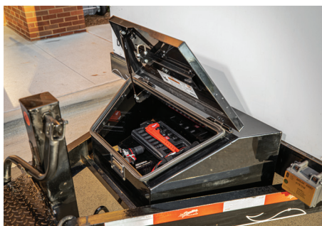
Convenient toolbox for frequently used items